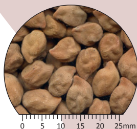
PBA HatTrick ®