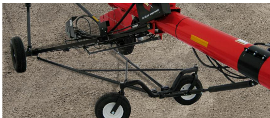
Self Propelled Kit