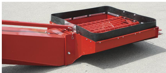
R Series Hopper