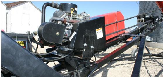
Multiple Drive Options

Introducing Wheatheart's R Series - The most maneuverable and easy-to-use truck auger in the industry!