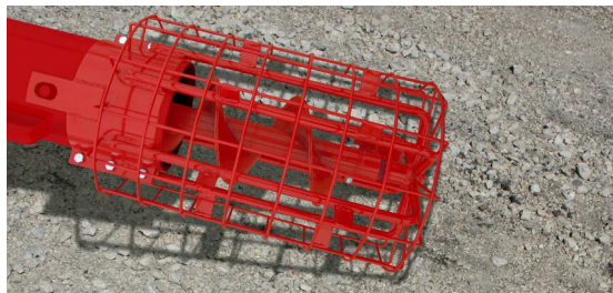
Removable Intake Flight