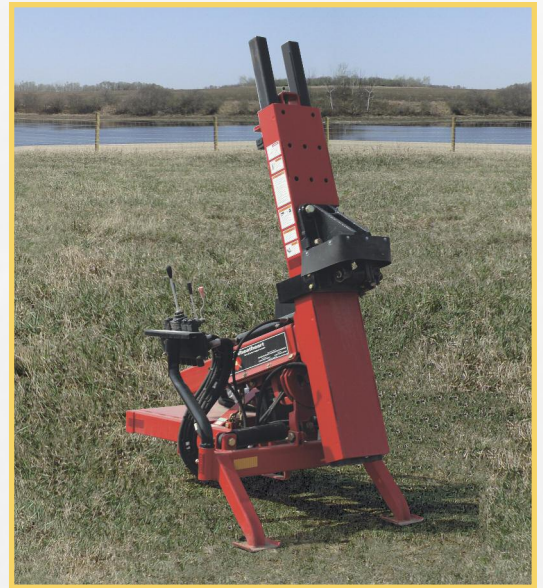
3pt Hitch Side Mast