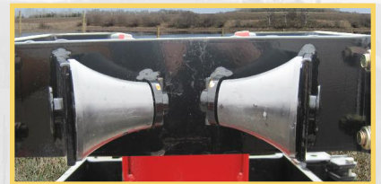
Cast Iron Cones