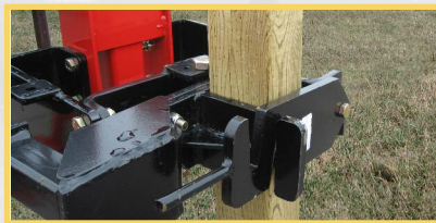
Square Post Hugger