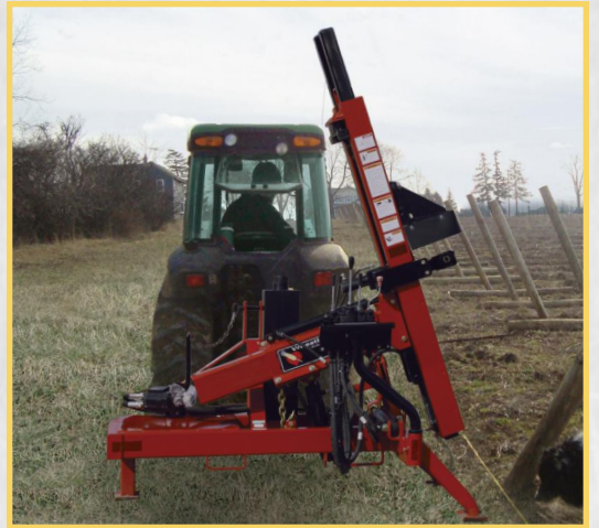
3pt Hitch Side Mast

3pt Hitch Models are free standing for additional safety while attaching or detaching from the tractor and offers a PTO driven self-contained hydraulic system.