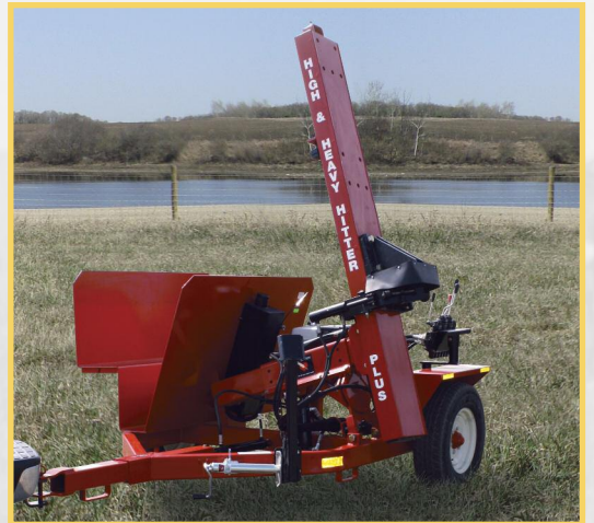
Trailer Model Plus