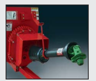
1000 PTO Drive Allows operation with high horsepower tractors (reverser included).