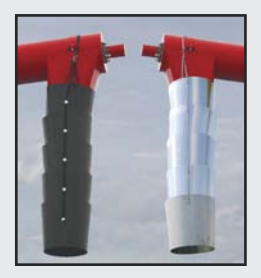
Flex Spouts Directs grain flow – reduces spillage. Available in poly plastic or galvanized metal.