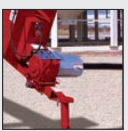
Right Angle Drive Assists operation in limited space situations. Allows a full arc on opposite side of tractor.